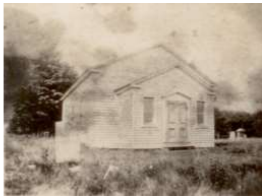
Primitive Methodist Connexion Church 1848-1914

There has been a church presence in the community of Drumquin since 1823. A sturdy log structure, located across Trafalgar Road from the current Bethel United Church, served as a schoolhouse. Community meeting place, and Methodist church.