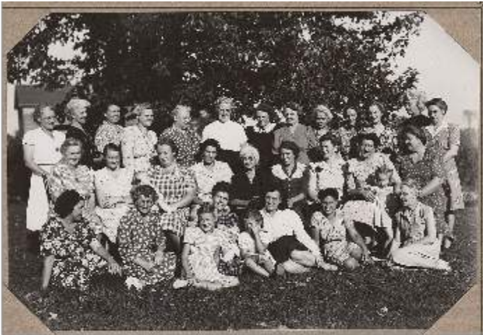
North Trafalgar Community Club, 1946