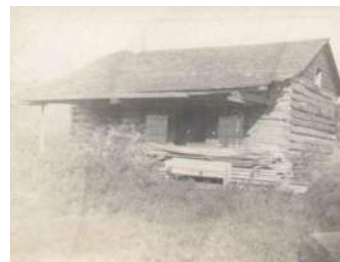
Lyon Homestead Cabin, built in 1820

In 1853, local schoolmaster Arthur Cole Verner (1811-90) divided his land into small holdings and called the land at the intersection of Upper Middle Road and 7th Line, north of the Town of Oakville, Vernerville. The settlement, however, failed to stand up to the heavy winters, and the dream of an "upper village" came to naught. Today, the Lyon Cabin is the only Vernerville building which remains.