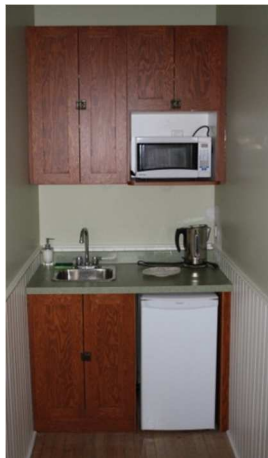
Old Kitchen removed to build an accesible bathroom and replace with a kitchen using same wood used in the rest of the Schoolhouse. The walls were restored to what would have been the original look with beadboard.