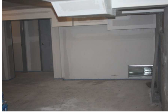
New furnace and duct work installed, oil tank removed, fire doors added in basement and ceiling and interior walls dry walled. Outside walls were waterproofed but interior injection of cracks still needed.