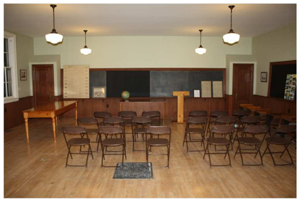
Floor sanded, a piece of slate added and a replica piece added in blackboard. (would like artist to finish it to be a closer replica) Wood floor sanded and varnished. All wood restored and antique brass hardware added to doors since there was not any hardware existing.