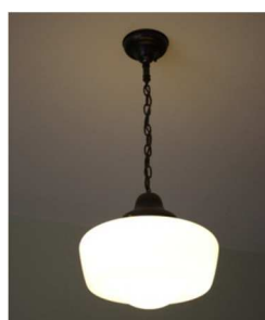
All Lights replaced with appropriate replicas