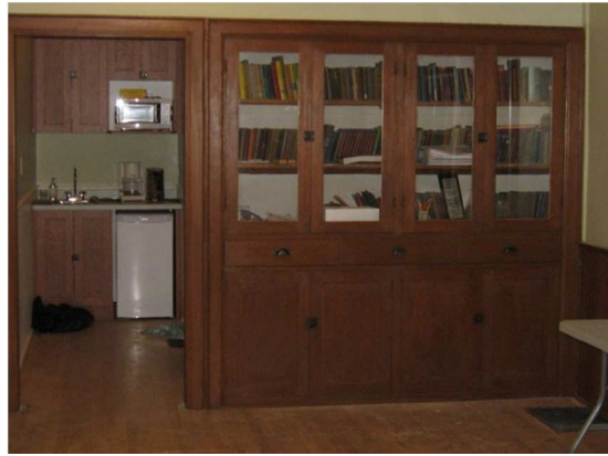
Bookcase restored and replica hardware added (We would still like to restore the glass to include the original panes)