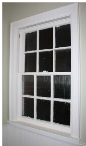
Missing wood trim was replicated around several windows to match existing trim on other windows.