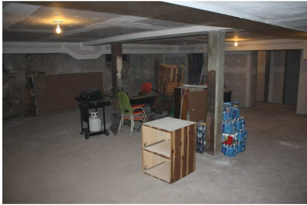
Furnace moved to sw corner to open up full basement for additional community use in the future