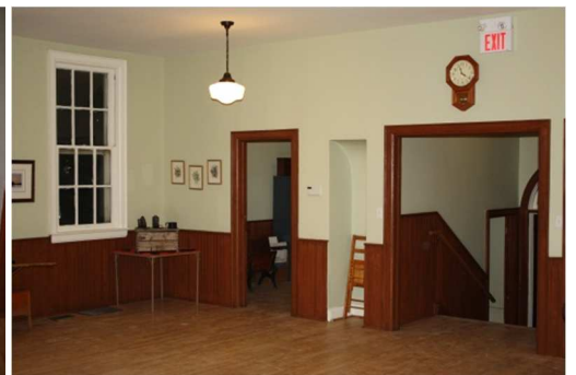
Wood trim stripped and stained, exit signs added. Note the Palermo hall chair donated to us this year