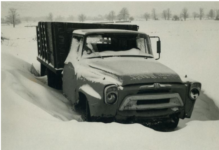
Photograph taken at the Ball Brothers' farm, ca. 1972.

Snow began to fall Invisible against The darkening sky. With frightening speed Giant flakes Dominated the January night. The ground turned white, And weathered shed boards Blended with the closing storm. The lane filled quickly, Trapping the distant barn All was quiet- No night creatures stirred. Almost imperceptibly The towering yard light Swayed, flickered, died. Blustery east winds rose Rattling ancient panes. The house groaned in The throes of another Winter.