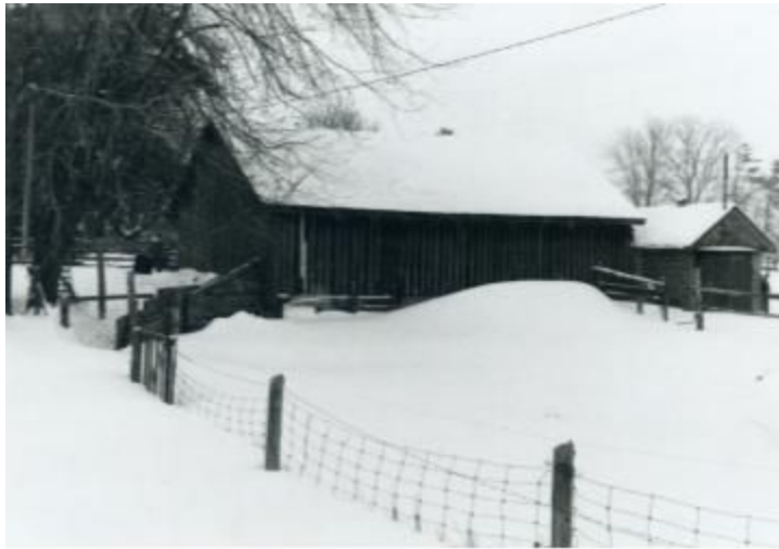
Photo of the Ball Brothers' Farm, showing the drive shed and old milk house, ca. 1972.