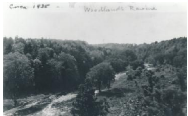
View of Bronte Creek from "Woodlands" property, taken by George S. Atkins ca. 1935.