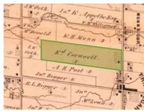
Lot allocation from 1877 Township survey, Lot 14 highlighted.