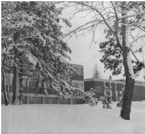
Gordon E. Perdue High School, 1967-68.