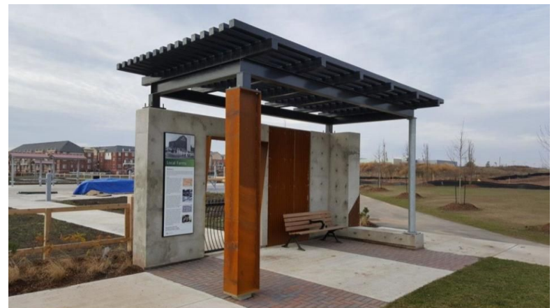
Installed in November 2016, the new plaques in Memorial Park commemorate area farming settlers in Trafalgar Township. Image: Town of Oakville.

An excerpt from the "Local Farms" plaque in Memorial Park. Image: Town of Oakville.